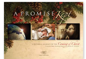
A Promise Kept: A Pictorial Journey of the Coming of Christ by Insight for Living softcover book