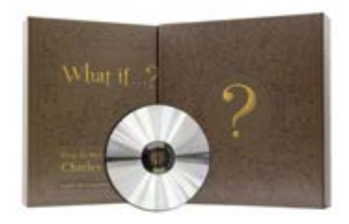
What If ...? by Charles R. Swindoll and Insight for Living Ministries Classic CD series

For these and related resources, visit www.insightworld.org/store or call USA 1-800-772-8888 • AUSTRALIA +61 3 9762 6613 • CANADA I-800-663-7639 • UK +44 1306 640156