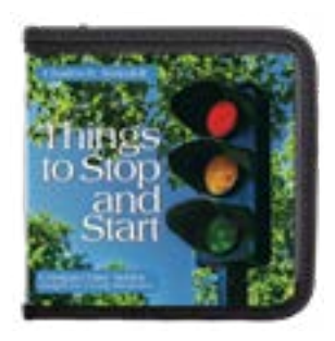
Things to Stop and Start by Charles R. Swindoll CD series