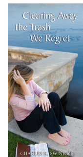
Clearing Away the Trash We Regret by Charles R. Swindoll booklet

For related resources, please call USA 1-800-772-8888 • AUSTRALIA +61 3 9762 6613 • CANADA 1-800-663-7639 • UK 0800 787 9364