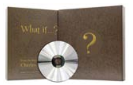
What If . . . ? by Charles R. Swindoll and Insight for Living Ministries Classic CD series