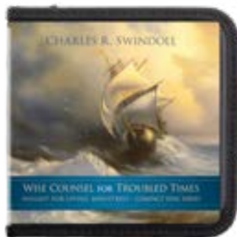
Wise Counsel for Troubled Times by Charles R. Swindoll CD series