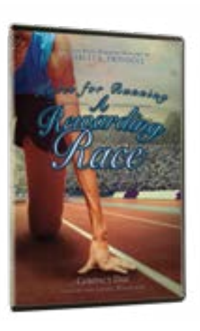
Rules for Running a Rewarding Race by Charles R. Swindoll CD message

For these and related resources, visit www.insightworld.org/store or call USA 1-800-772-8888 • AUSTRALIA +61 3 9762 6613 • CANADA 1-800-663-7639 • UK +44 1306 640156