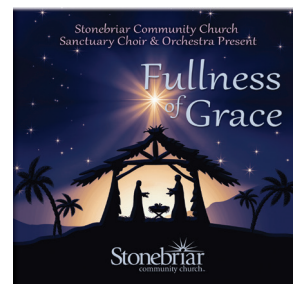
Fullness of Grace by Charles R. Swindoll and Stonebriar Community Church CD

For these and related resources, visit www.insightworld.org/store or call USA 1-800-772-8888 • AUSTRALIA +61 3 9762 6613 • CANADA 1-800-663-7639 • UK +44 1306 640156