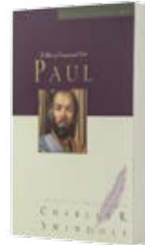
Paul: A Man of Grace and Grit by Charles R. Swindoll softcover book

For these and related resources, visit www.insightworld.org/store or call USA 1-800-772-8888 • AUSTRALIA +61 3 9762 6613 • CANADA 1-800-663-7639 • UK +44 1306 640156