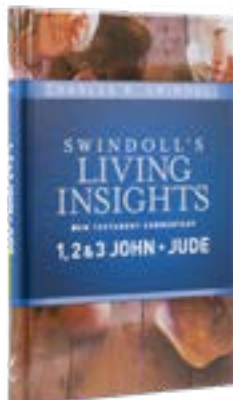
Swindoll's Living Insights New Testament Commentary Insights on 1, 2 & 3 John, Jude by Charles R. Swindoll Hardcover book