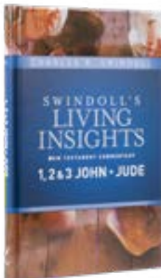
Swindoll's Living Insights New Testament Commentary Insights on 1, 2 & 3 John, Jude by Charles R. Swindoll Hardcover book