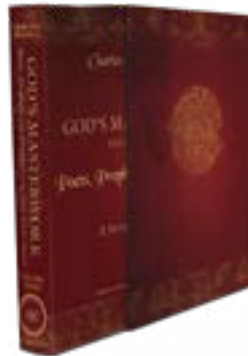
God's Masterwork, Volume Three: Poets, Prophets, and Promises— A Survey of Job–Daniel by Charles R. Swindoll CD series