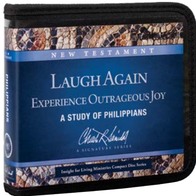
Laugh Again: Experience Outrageous Joy by Charles R. Swindoll CD series