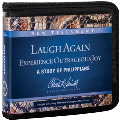
Laugh Again: Experience Outrageous Joy by Charles R. Swindoll CD series