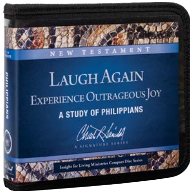
Laugh Again: Experience Outrageous Joy by Charles R. Swindoll CD series