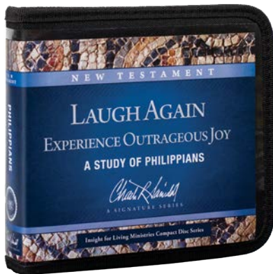
Laugh Again: Experience Outrageous Joy by Charles R. Swindoll CD series