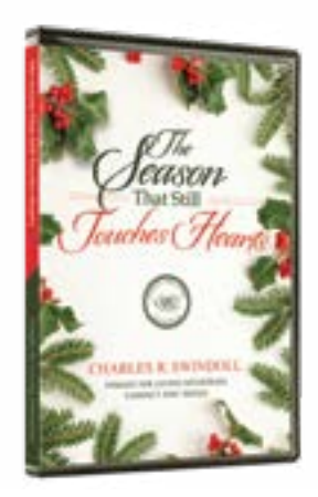
The Season That Still Touches Hearts by Charles R. Swindoll CD series