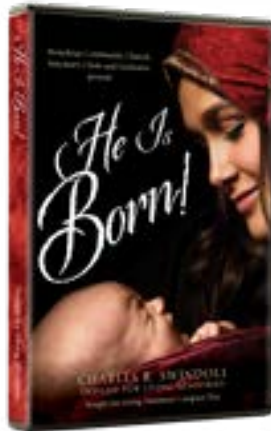
He Is Born by Stonebriar Community Church Choir and Orchestra compact disc