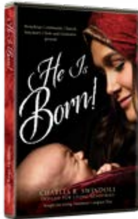
He Is Born by Stonebriar Community Church Choir and Orchestra compact disc