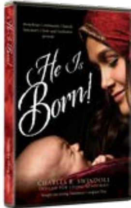
He Is Born by Stonebriar Community Church Choir and Orchestra compact disc