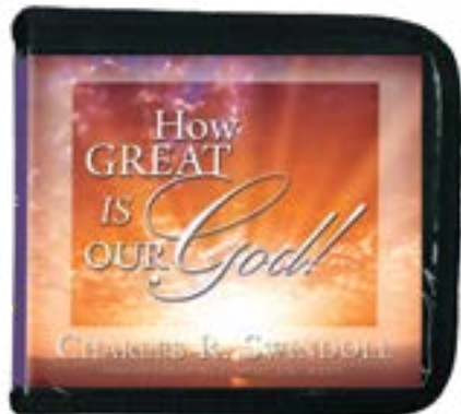
How Great Is Our God by Charles R. Swindoll CD series