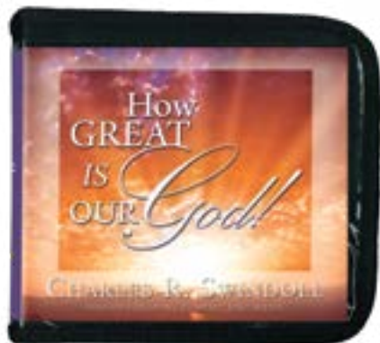
How Great Is Our God by Charles R. Swindoll CD series