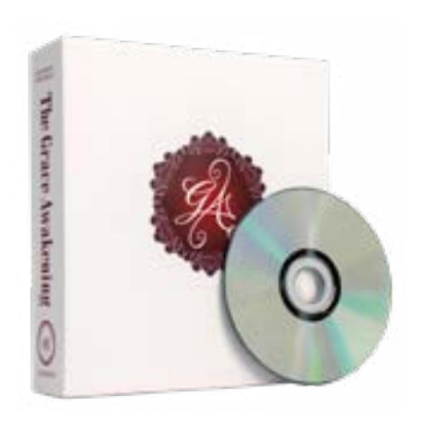
The Grace Awakening by Charles R. Swindoll CD series