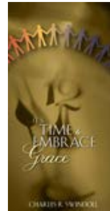
It's Time to Embrace Grace by Charles R. Swindoll booklet

For these and related resources, visit www.insightworld.org/store or call USA 1-800-772-8888 • AUSTRALIA +61 3 9762 6613 • CANADA 1-800-663-7639 • UK +44 1306 640156