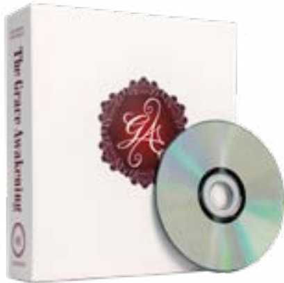
The Grace Awakening by Charles R. Swindoll CD series