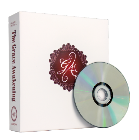
The Grace Awakening by Charles R. Swindoll CD series