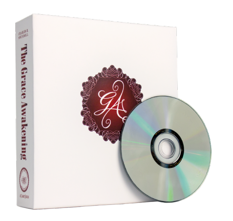
The Grace Awakening by Charles R. Swindoll CD series