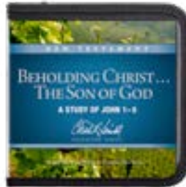
Beholding Christ . . . The Son of God: A Study of John 1–5 by Charles R. Swindoll CD series