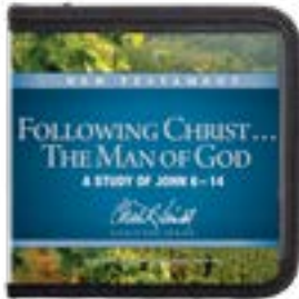
Following Christ . . . The Man of God: A Study of John 6–14 by Charles R. Swindoll CD series