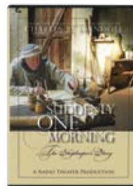
Suddenly One Morning Radio Theater by Charles R. Swindoll single CD

For these and related resources, visit www.insightworld.org/store or call USA 1-800-772-8888 • AUSTRALIA +61 3 9762 6613 • CANADA 1-800-663-7639 • UK +44 1306 640156