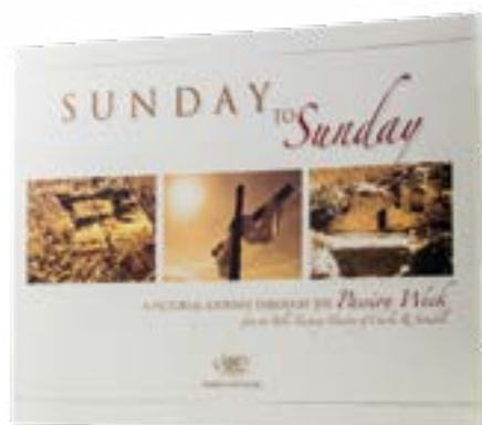
Sunday to Sunday by Charles R. Swindoll and Insight for Living Ministries softcover book