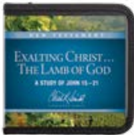
Exalting Christ . . . The Lamb of God: A Study of John 15–21 — A Signature Series by Charles R. Swindoll CD series