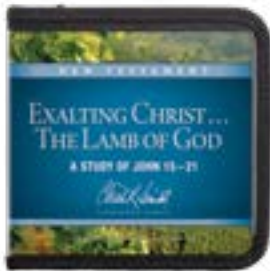
Exalting Christ . . . The Lamb of God: A Study of John 15–21 — A Signature Series by Charles R. Swindoll CD series