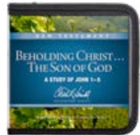
Beholding Christ . . . The Son of God: A Study of John 1–5 — A Signature Series by Charles R. Swindoll CD series

For these and related resources, visit www.insightworld.org/store or call USA 1-800-772-8888 • AUSTRALIA +61 3 9762 6613 • CANADA 1-800-663-7639 • UK +44 1306 640156