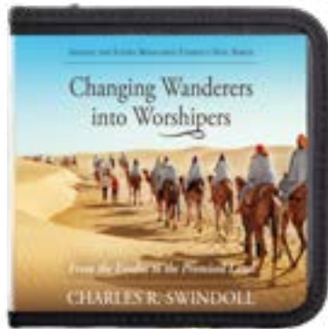
Changing Wanderers into Worshipers: From the Exodus to the Promised Land by Charles R. Swindoll CD series