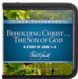
Beholding Christ . . . The Son of God by Charles R. Swindoll CD series