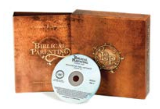
Biblical Parenting by Charles R. Swindoll CD series