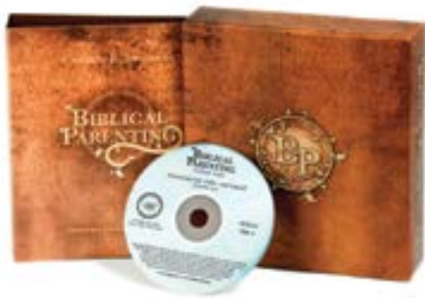
Biblical Parenting by Charles R. Swindoll CD series