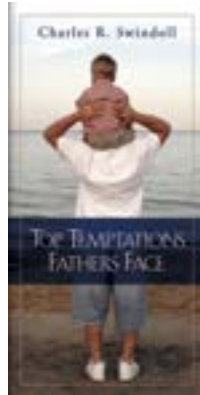
Top Temptations Fathers Face by Charles R. Swindoll booklet