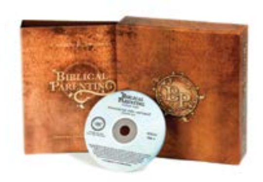
Biblical Parenting by Charles R. Swindoll CD series