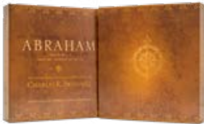
Abraham: One Nomad's Amazing Journey of Faith by Charles R. Swindoll Classic CD series