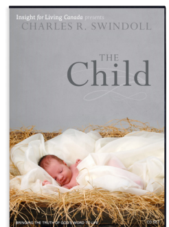
The Child message series

To order any of these recommended resources, call 1-800-663-7639 or visit insightforliving.ca