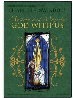
Mystery and Majesty: God With Us by Charles R. Swindoll CD series