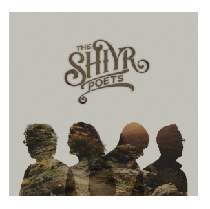
Songs for the Journey, Volume 1 The SHIYR Poets music CD