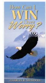
How Can I Win Over Worry? by Charles R. Swindoll booklet