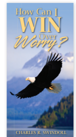
How Can I Win Over Worry? by Charles R. Swindoll booklet