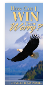
How Can I Win Over Worry? by Charles R. Swindoll booklet