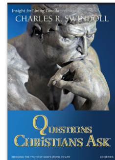
Questions Christians Ask by Charles R. Swindoll CD series