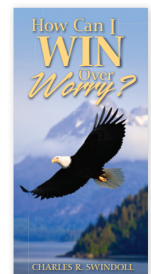
How Can I Win Over Worry? by Charles R. Swindoll booklet