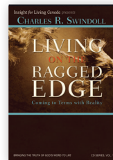
Living on the Ragged Edge by Charles R. Swindoll Classic CD series and softcover workbook