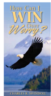
How Can I Win Over Worry? by Insight for Living booklet