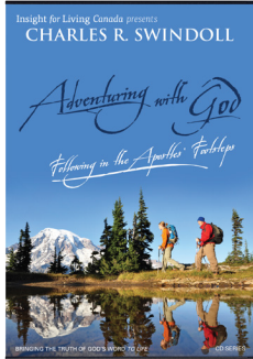
Adventuring with God by Charles R. Swindoll message series