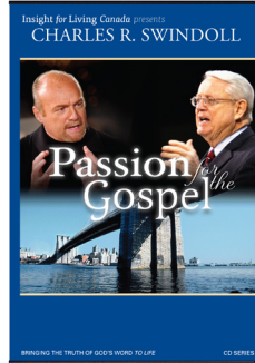
Passion for the Gospel by Charles R. Swindoll and Greg Laurie message series