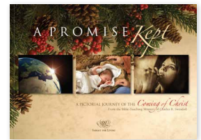
A Promise Kept: A Pictorial Journey of the Coming of Christ by Insight for Living softcover book