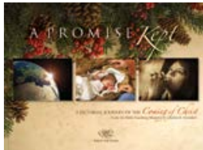
A Promise Kept by Insight for Living Ministries Pictorial devotional