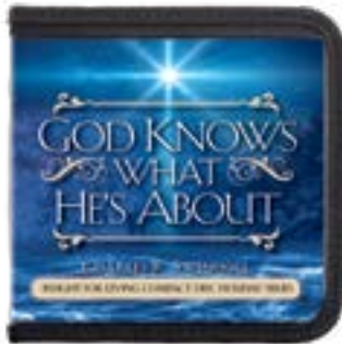
God Knows What He's About by Charles R. Swindoll CD series