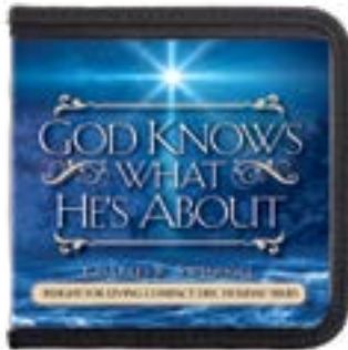
God Knows What He's About by Charles R. Swindoll CD series