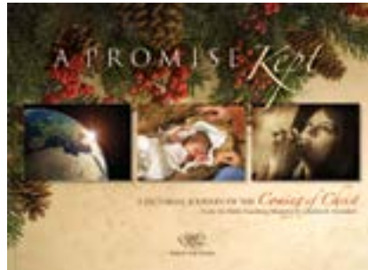
A Promise Kept by Insight for Living Ministries Pictorial devotional