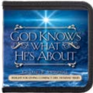
God Knows What He's About by Charles R. Swindoll CD series