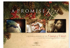
A Promise Kept: A Pictorial Journey of the Coming of Christ by Insight for Living softcover book

To order any of these recommended resources, call 1-800-663-7639 or visit insightforliving.ca